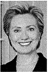
HILLARY CLINTON Democratic front-runner