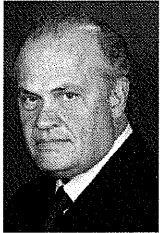
FRED THOMPSON Actor to president?